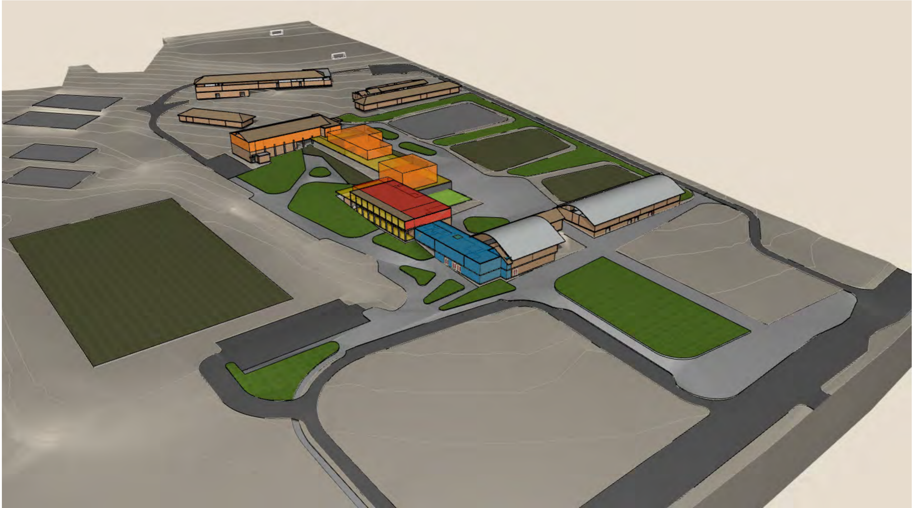
Masterplan | East View