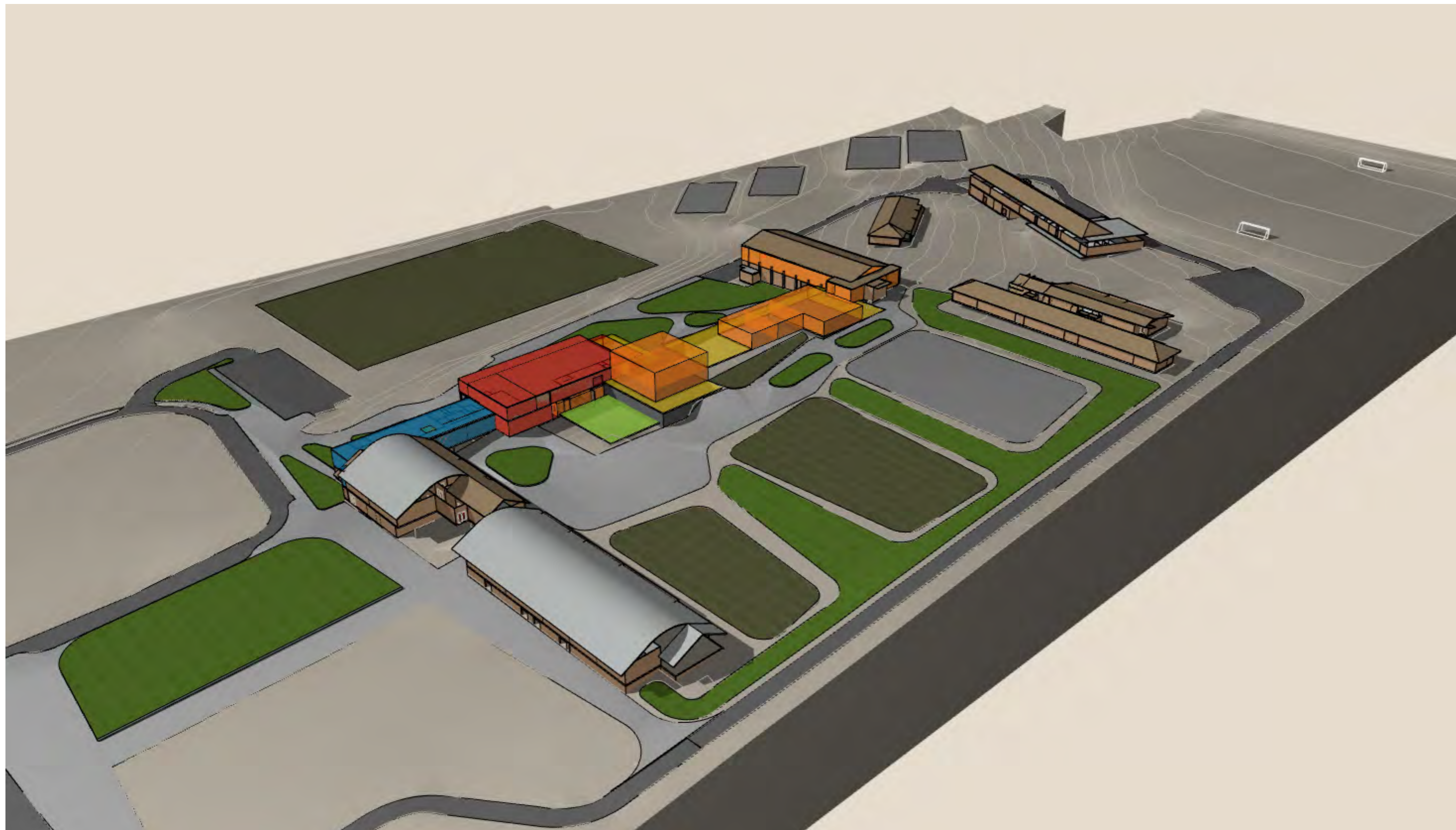
Masterplan | North East View