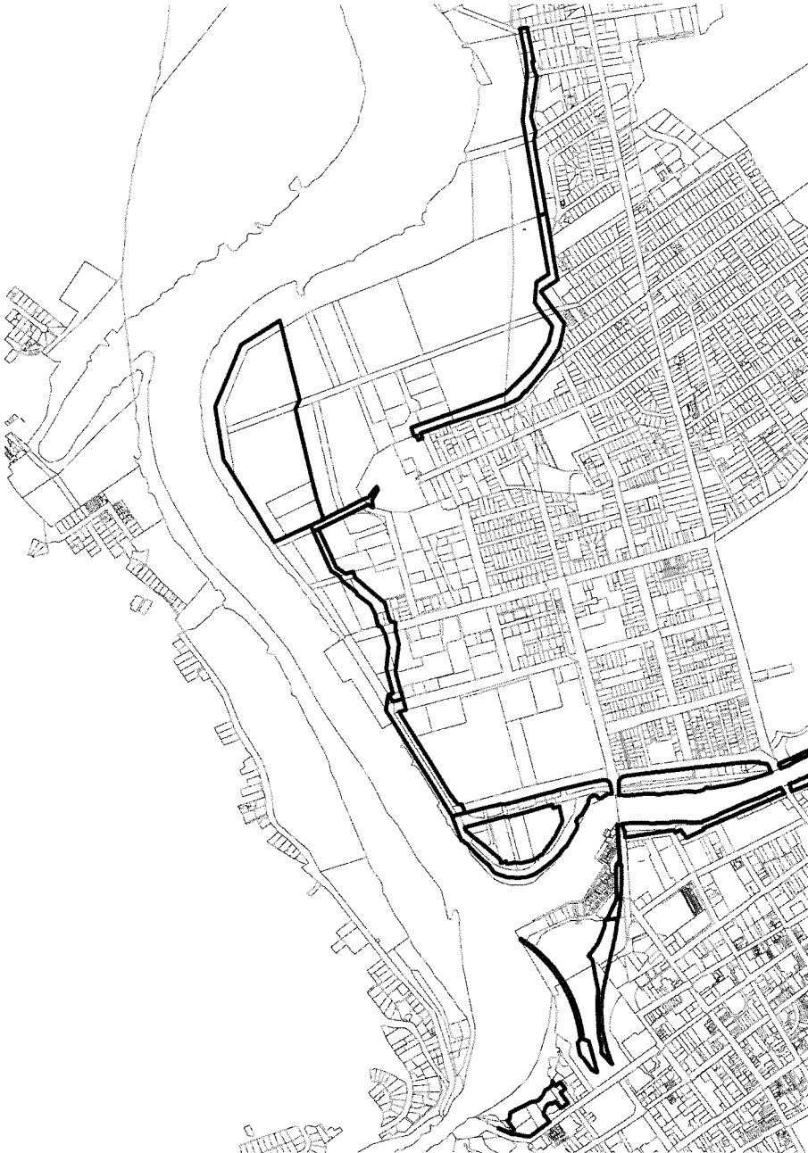
Map 2 – Detail of Map 1