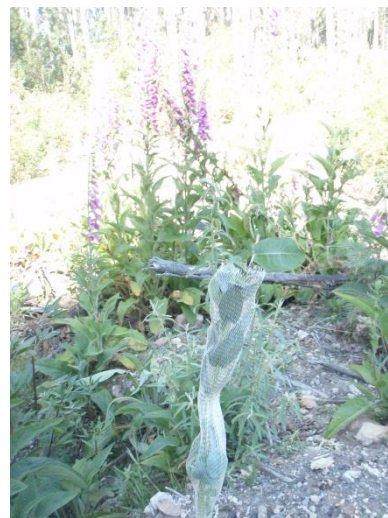
“Seeded plantation for TaAnn”?