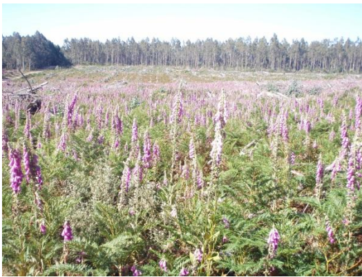
New cleafell, next coupe in background