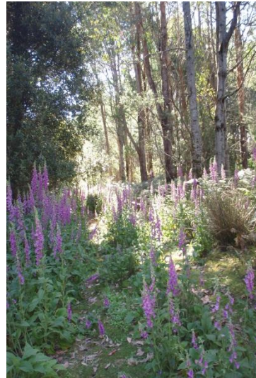
Track bordering my property