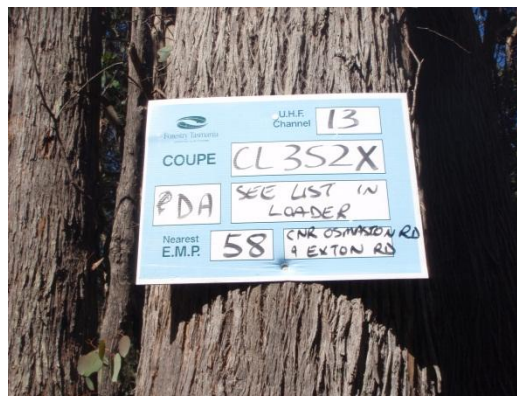
Ongoing clear fell logging activities