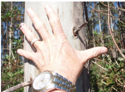
Average tree diameter to be logged