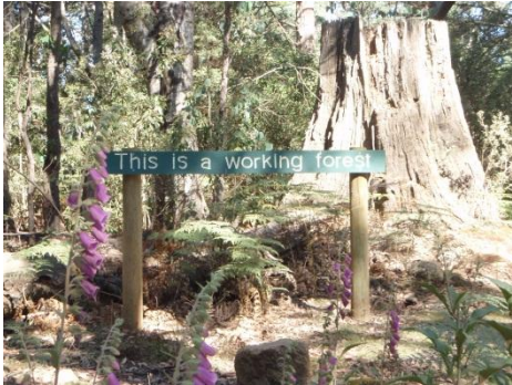
A working forest!