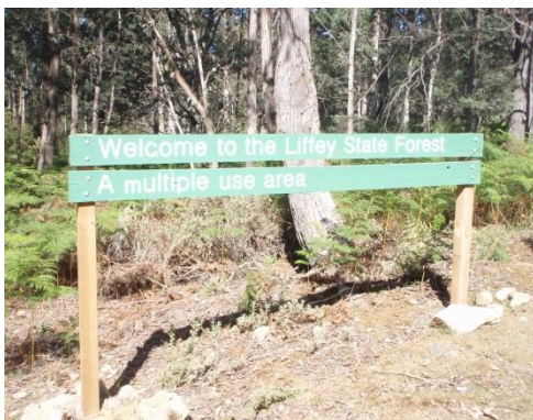
Welcome sign on Riversdale Road