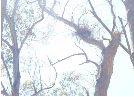
Eagle nest about 30 metres off Coupe BA388D boundary

There is little doubt that the FT is conducting a working forest activity consisting of foxglove infestation of the Liffey State Forest (and the access road to the Liffey Falls WHA); the clear felling of immature plantation; seeded plantation regrowth; and the destruction of animal and birdlife habitat.