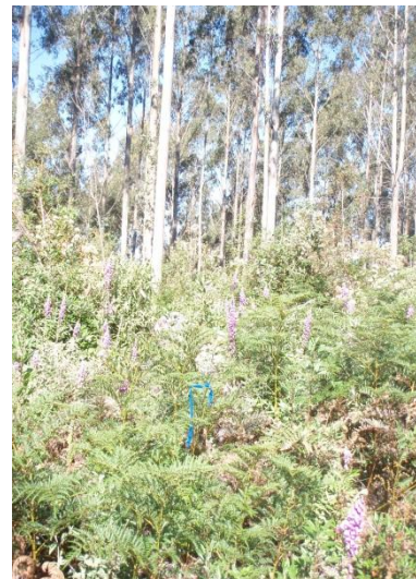
Proposed logging area