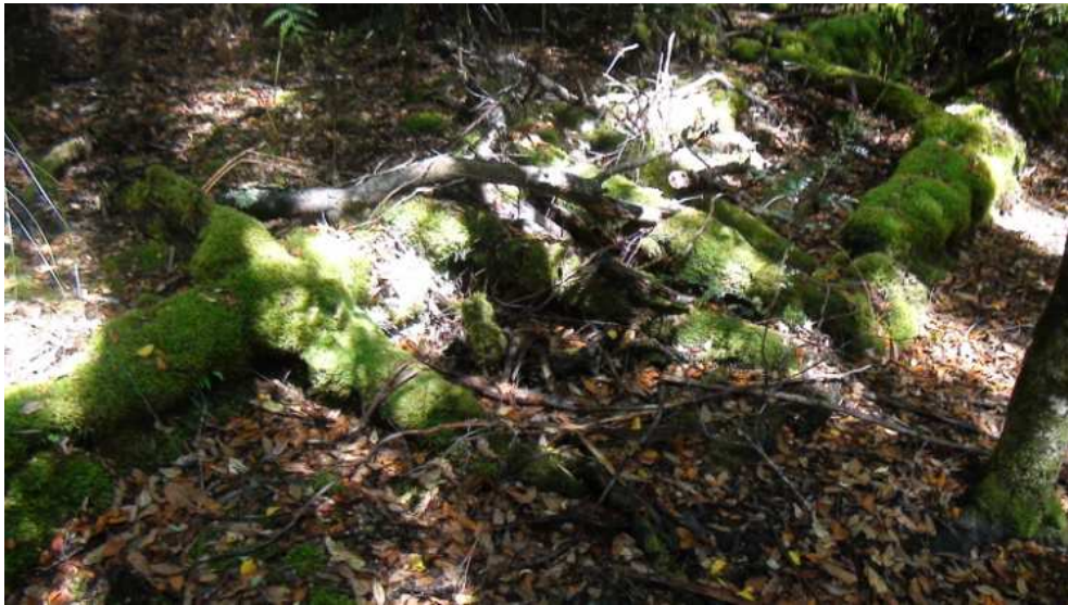
Figure 1 Historic timber getting Tram way

Images from Lot 125 (Polygon 125) High Conservation Value forest proposed to be added to the Tasmanian Wilderness World Heritage Area