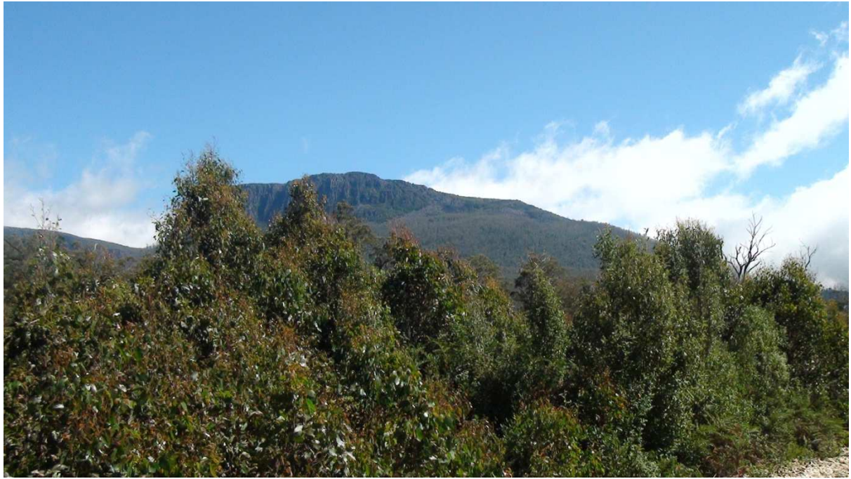
Figure 5 Recent Regrowth, looking north to Mother Cummings Peak