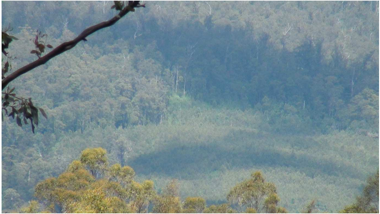
Figure 7 recently regenerated clear fell coupe