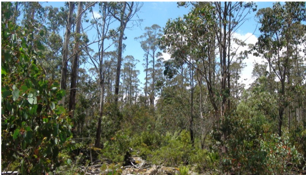
Figure 4 HU307