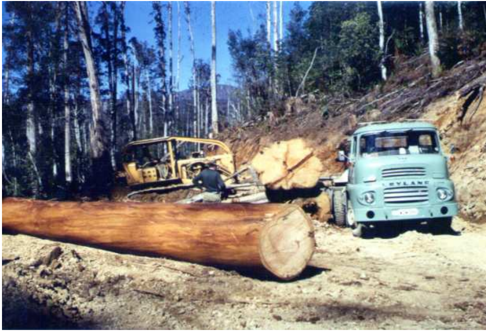
Figure 3 Smoko Road, 1960s