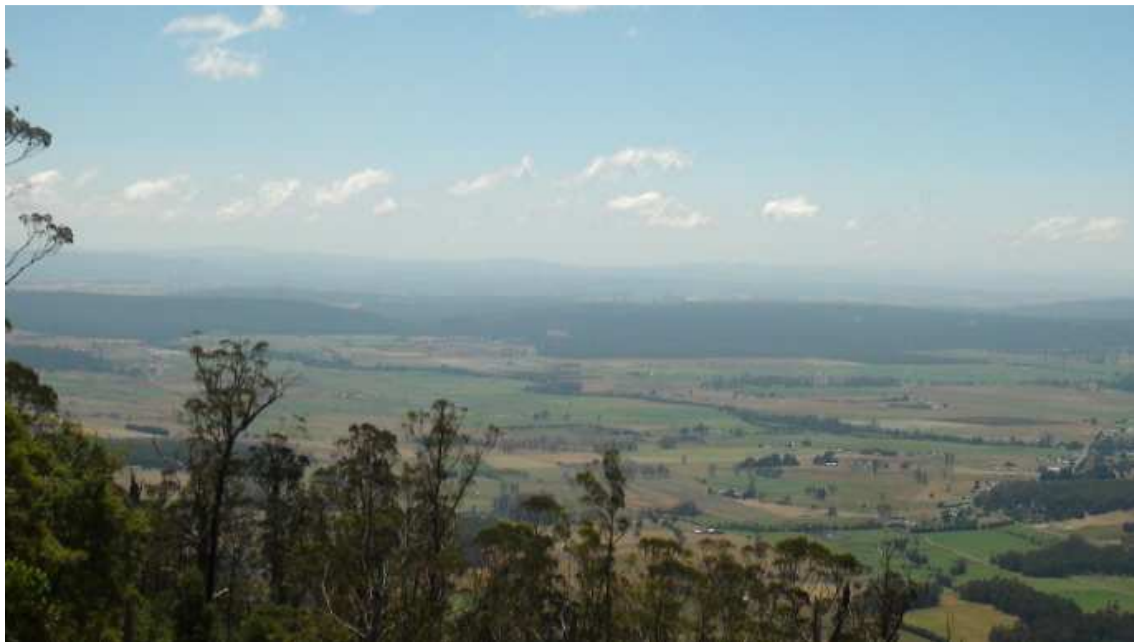
Figure 6 Vista from Community look-out on Scott's Road