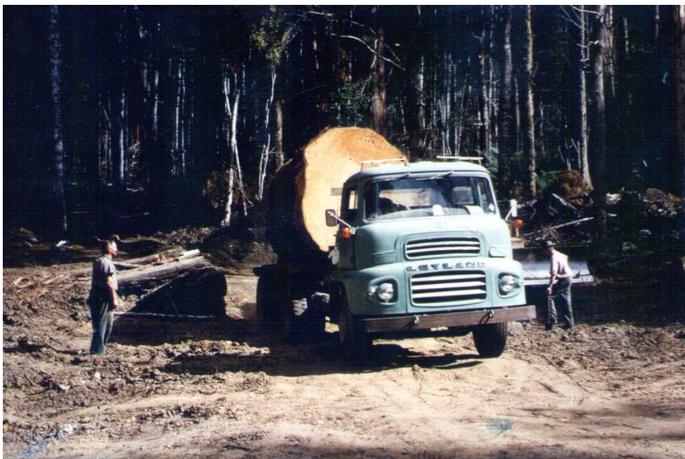
Figure 2 Bessel's road, 1960