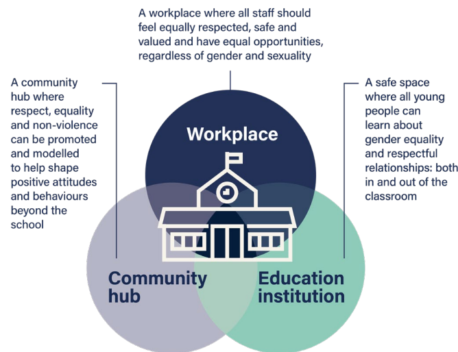
Figure 2: schools as workplaces, community hubs and educational institutions

Schools are workplaces where structures, norms and practices can support gender equality for staff and students 41 . They hold significant influence and can act to both reinforce gendered dichotomies as well as reduce perceived differences 42 . For example, approximately 71.9% of Australian classroom teachers identify as women 43 although traditional masculine practices are active within certain sites such as curriculum divisions, discipline systems and sports 44 . Informal cultures and practices of the workplace directly impact on what students are learning about gender equality, respect and professional relationships. Whole school approaches to RRE support these workplace practices to model healthy relationships and processes.