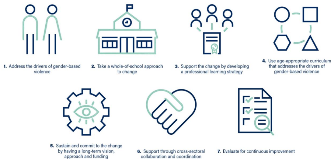
Figure 1: seven core elements of evidence-based RRE

RRE is the holistic approach to school-based, primary prevention of gender-based violence, which includes teaching and learning about healthy relationships, gender, power and control. 37