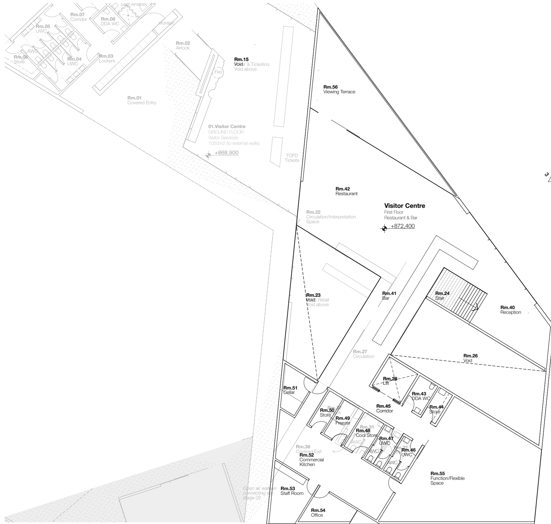
1 First Floor Plan 1:200