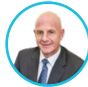
The Hon Will Hodgman MP Premier of Tasmania