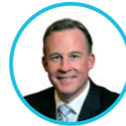
The Hon Alan Tudge MP Minister for Cities, Urban Infrastructure and Population