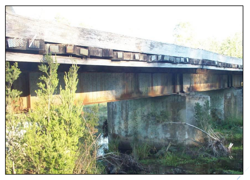
Figure 18. - Bridge at 47.8km

The deck of this bridge is timber, the beams are steel and the abutments and piers are concrete. The bridge is in reasonable condition throughout.