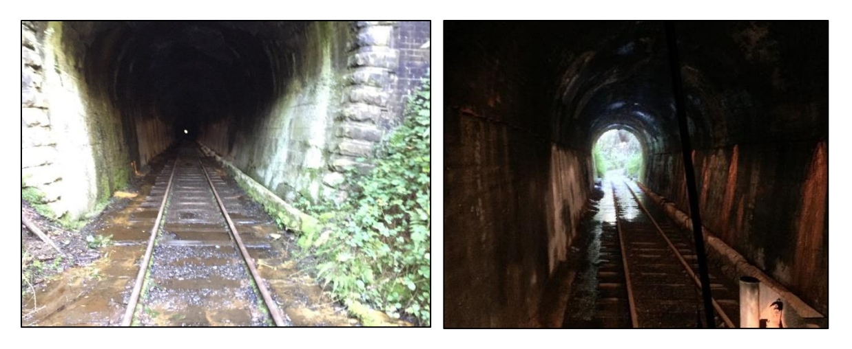
Figure 20. – Pictures of tunnel showing failed drainage system and flooded track

The tunnel appears to be generally in reasonable condition apart from drainage issues as can be seen in the pictures below taken at both ends of the tunnel.