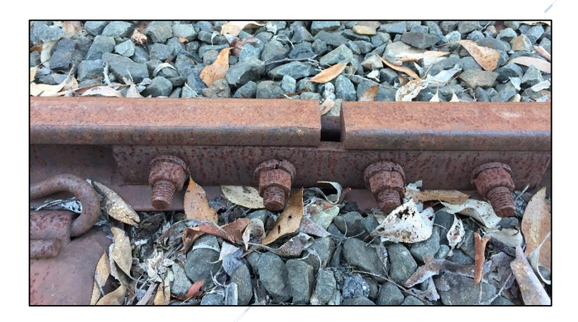
Figure 1. – Rusted fishplate

The rails on the line consist of nominal 30 kg/m rail and 40kg/m rail. The rails are generally in a satisfactory condition for carrying the rail car or the steam train. The rails are generally in short lengths with fish plated joints. All of the fish plated joints that were observed in the site inspection are rusted and appear to be frozen. Figure 1 below shows a picture of the rusted fishplates and figure 2 shows the area of concern.