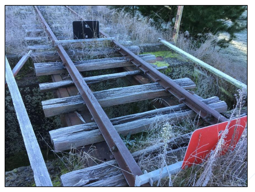
Figure 13. - Bridge at 23.6km

The bridge has an open deck, the beams are steel and the abutments are concrete. The bridge is in reasonable condition except for the transoms (sleepers that have been machined to a uniform depth). The transoms require replacing before trains commence operation.