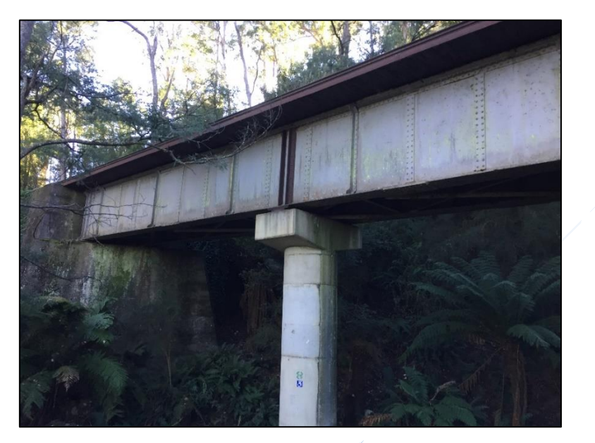
Figure 15. - Bridge at 24.2km

This bridge has 2 No. 15m metre spans. A picture of this bridge is shown below.