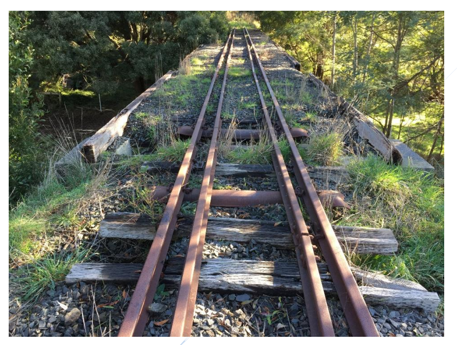
Figure 17. - Bridge at 47.65km

This bridge has 3 No. 17m metre spans. A picture of this bridge is shown below.