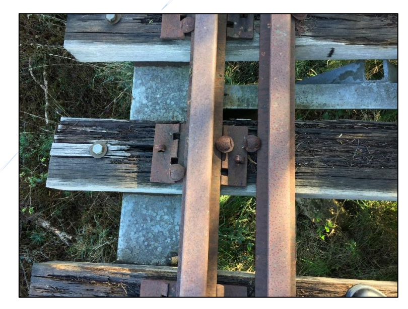
Figure 16. - Bridge at 45.8km

This bridge has 2 No. 11m metre spans. A picture of part of this bridge is shown below.