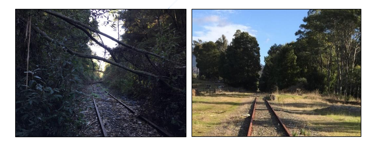
Figure 22. – Examples of areas requiring vegetation clearing

In a number of locations, it will be necessary to cut back trees and bushes that have grown close to the line. This will be particularly needed for the operation of a steam train because of the risk of fires starting from sparks. The pictures below show two locations were vegetation will be a problem.