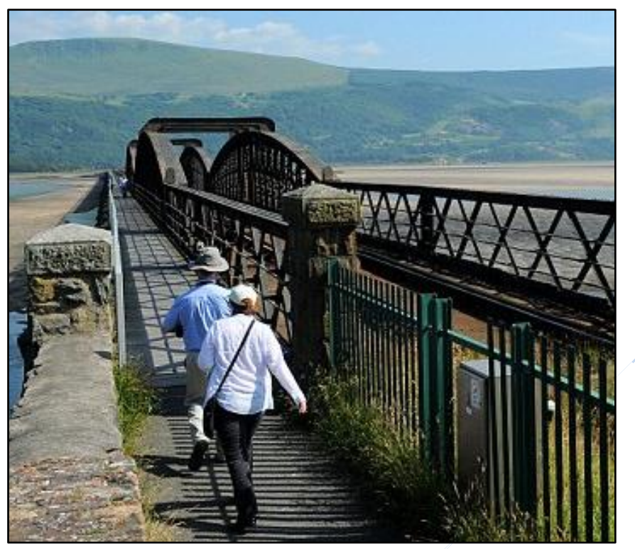
Figure 25. – Pathway next to a rail bridge