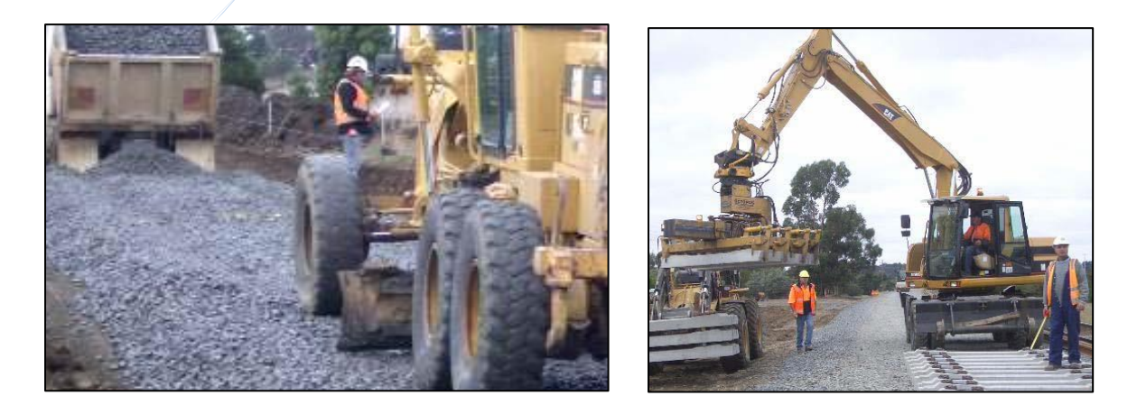
Figure 9. - Showing some of the work involved in rebuilding a level crossing

The level crossing track reconstruction involves removing the road surface material and track then rebuilding the track and reinstating the road surface. Figure 9 depicts the type of work involved in rebuilding the crossings after it has been opened up.