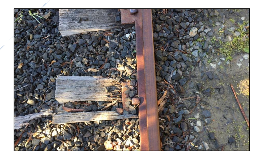
Figure 3. – Life expired sleeper

The timber sleepers have deteriorated with exposure to the elements. Figure 3 below shows a badly deteriorated sleeper which is reflective of a small percentage of sleepers, but many others are showing signs of rotting and splintering and also need replacement.