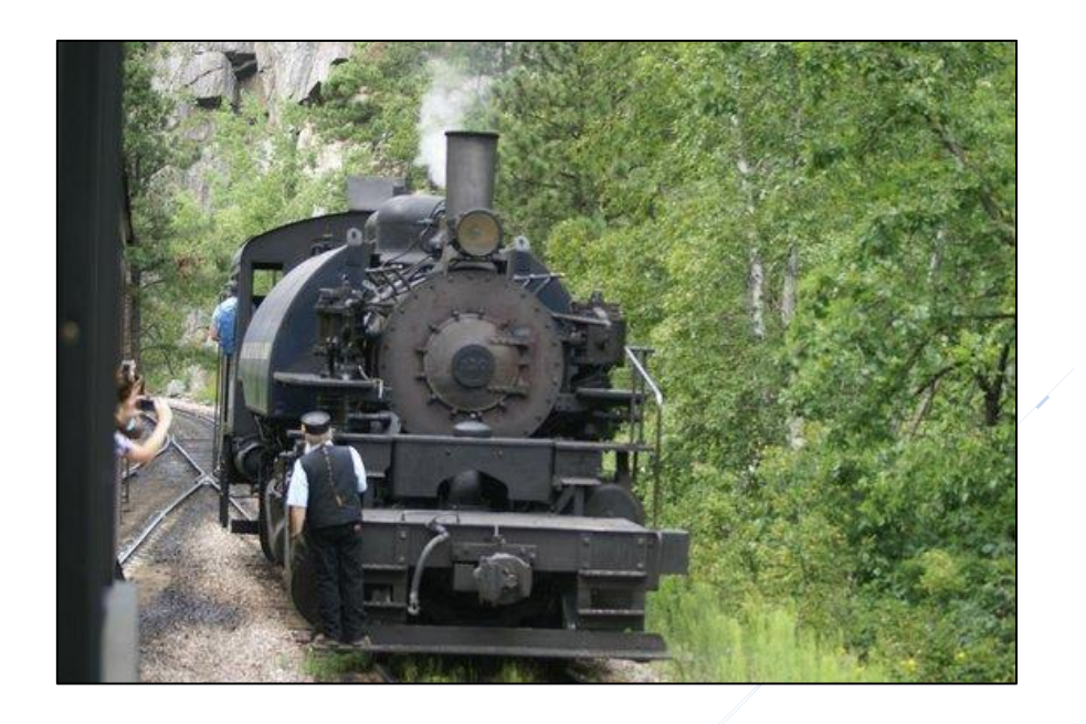
Figure 23. – A steam loco changing ends on a typical engine run around track

where steam trains run from Turners Marsh all the way to Scottsdale. This facility is referred to as an engine run around. Figure 23 shows a steam engine using an engine run around facility to place the loco on the opposite end of the train for a return journey.