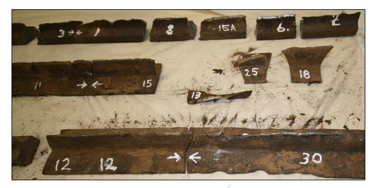
Figure 8. – Broken rusted rail taken from a crossing after the rail causing a derailment

a picture of a broken corroded rail taken from a crossing after the rail broke under a train causing a serious derailment.