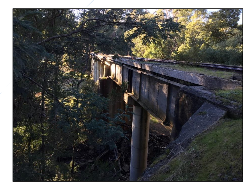
Figure 11. - Bridge at 13.5km - Karoola

This bridge has 10 No. 10m metre spans. A picture of this bridge is shown below.