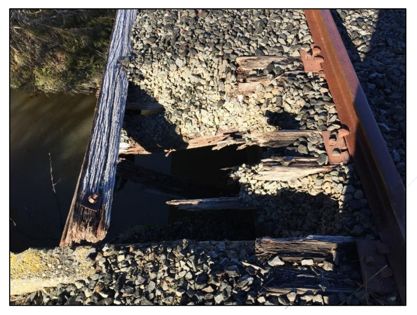
Figure 12. – Picture of a collapsing bridge deck - typical of many bridge decks on the North East line

The deck of this bridge is timber, the beams are steel and the abutments and piers are concrete. The bridge is in reasonable condition except for the timber deck. The deck is falling away in some places and requires replacement. Timber deck rotting occurs on many of the bridges and the picture below clearly shows the issue.