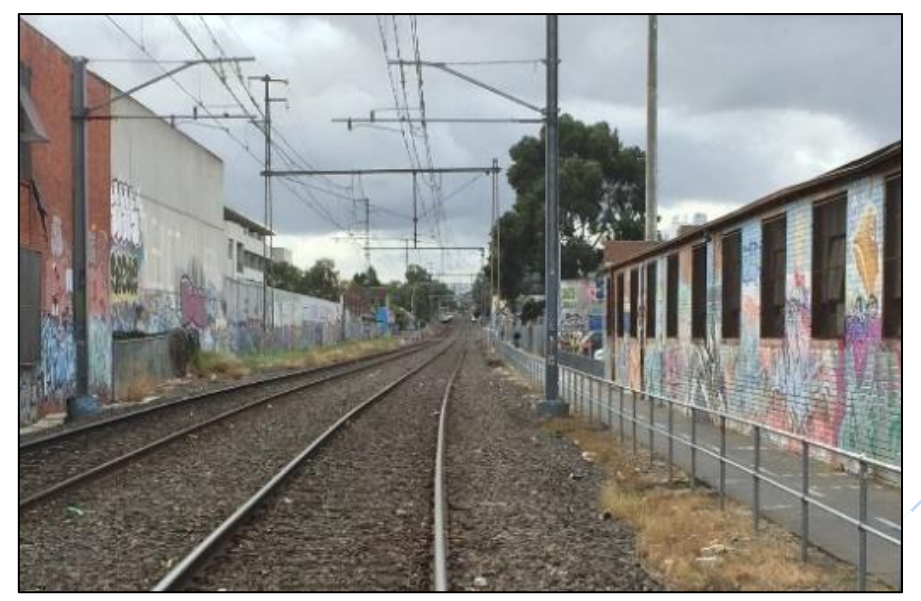
Figure 24. – Picture of Upfield line bike path in Victoria

The terrain between Turners Marsh and Scottsdale does not look like the terrain encountered on the Upfield rail line. Instead of being flat land, the Scottsdale line passes through undulating land where the rail line is frequently in a cutting, on an embankment and occasionally on a bridge structure. This feature would make it a lot more difficult and costly to construct a co-located bike path than was the case on the Upfield rail line in Victoria. It is recommended that an assessment of the earthworks required to widen embankments and cuttings be undertaken before a decision on this issue is made.