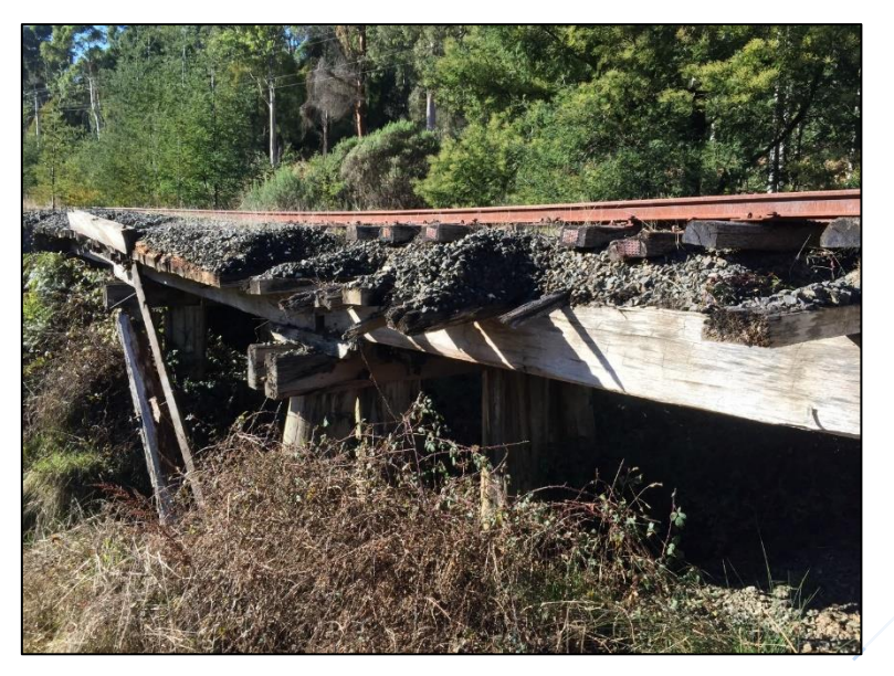
Figure 15. - Bridge at 37.75km

As can be seen in the photo, this bridge is built entirely of timber. It is collapsing and requires total replacement.