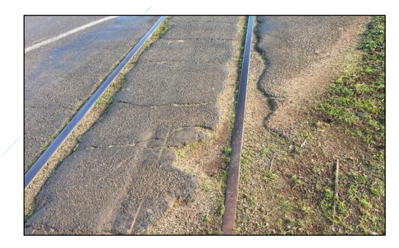
Figure 7. – Deteriorated level crossing at Scottsdale

The line to Scottsdale has a number of level crossings and the track beneath the crossing surface has not had any maintenance since at least the time train services were suspended. Figure 7 below shows the deteriorated level crossing at Scottsdale.