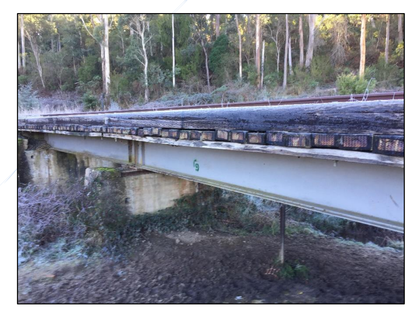
Figure 14. - Bridge at 23.85km

This bridge has 2 No. 8m metre spans. A picture of this bridge is shown below.