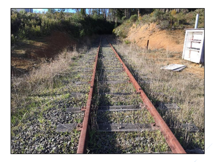
Figure 21. – Picture of silted cess drains