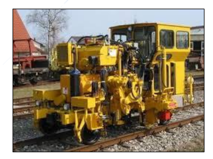
Figure 5. – Example of a small tamping machine

In the operational scenarios where only the lightweight rail car is to be operated the timber sleeper it is considered that the replacement rate could be reduced to 1 in 4 on straight track and 1 in 3 on