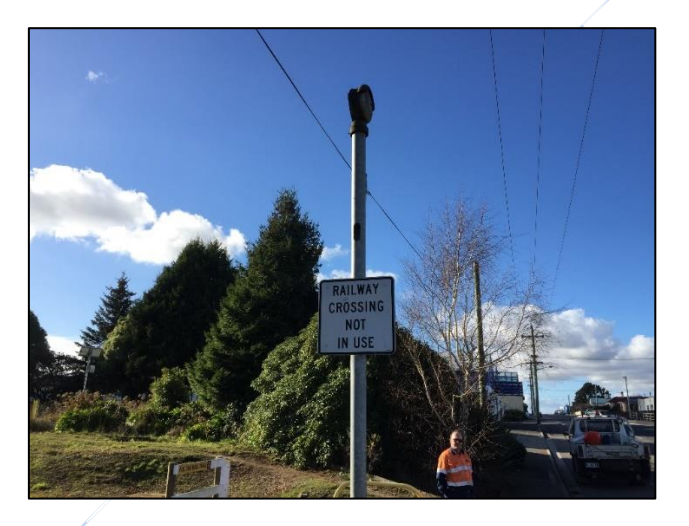
Figure 10. - Abandoned level crossing with only a post remaining

TasRail advises that between Turners Marsh and Scottsdale there were 10 level crossings that were protected by flashing lights, while L&NER itself suggest up to 15 actively controlled crossings may be required. Most of the level crossing protection system, including the bells and the equipment boxes, has been removed. This will mean an almost total rebuild of the system will be required prior to the reintroduction of train running. Figure 10 shows a picture of an abandoned level crossing at Scottsdale where all that remains of the protection system is the pole on which the bells used to be mounted.