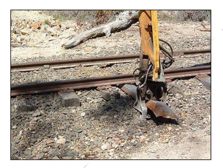
Figure 4. – Steel sleeper being inserted in track

As part of the track rehabilitation, it will be necessary to replace some timber sleepers. The accepted practice on heritage railways, operating steam trains, is to have at least 1 in every 3 sleepers on straight track in good condition and capable of holding gauge. In other words capable of preventing the rails from moving outward under the load of the train. On curves, the practice is to have 1 in 2 sleepers capable of holding gauge and acting as bearers. The picture in figure 4 below shows the type of plant normally used during the partial resleepering process. This sleeper inserter mechanism can be mounted on a backhoe or small excavator. Figure 5 shows a typical small tamping machine that is used to tamp the replacement steel sleeper. This ensure ballast is well compacted under the steel sleeper thereby making it capable of carrying the forces applied under the load of a train.