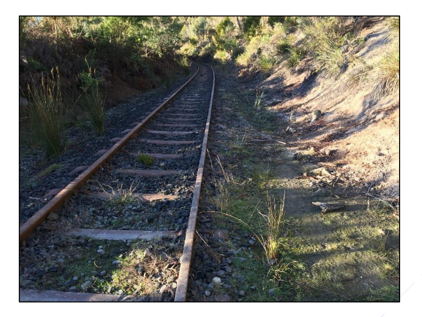
Figure 6. – Example of a silted cess drain