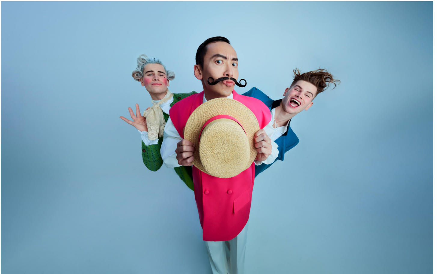
Opera Australia, The Barber of Seville .