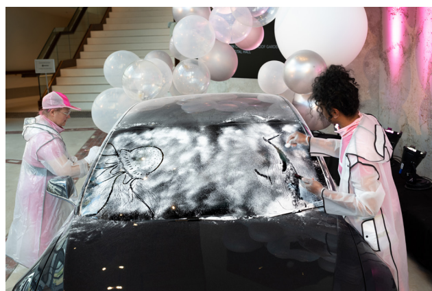
ARTwash RAWspace 2022.