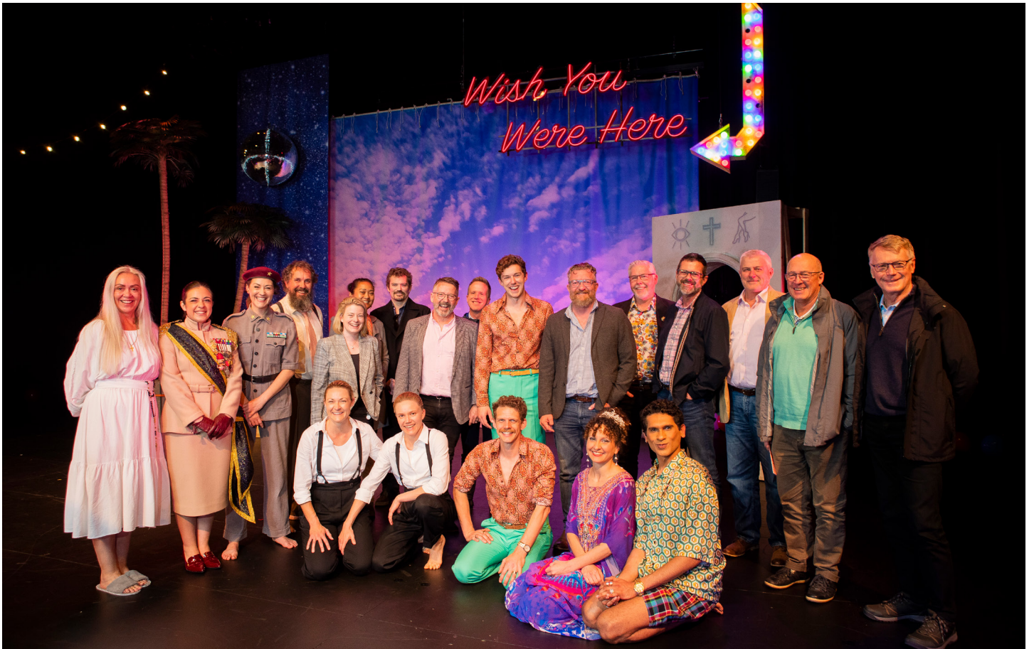
Bell Shakespeare, The Comedy of Errors, October 2022. On stage photo with Production Partner Ian Gurner Dental Care.