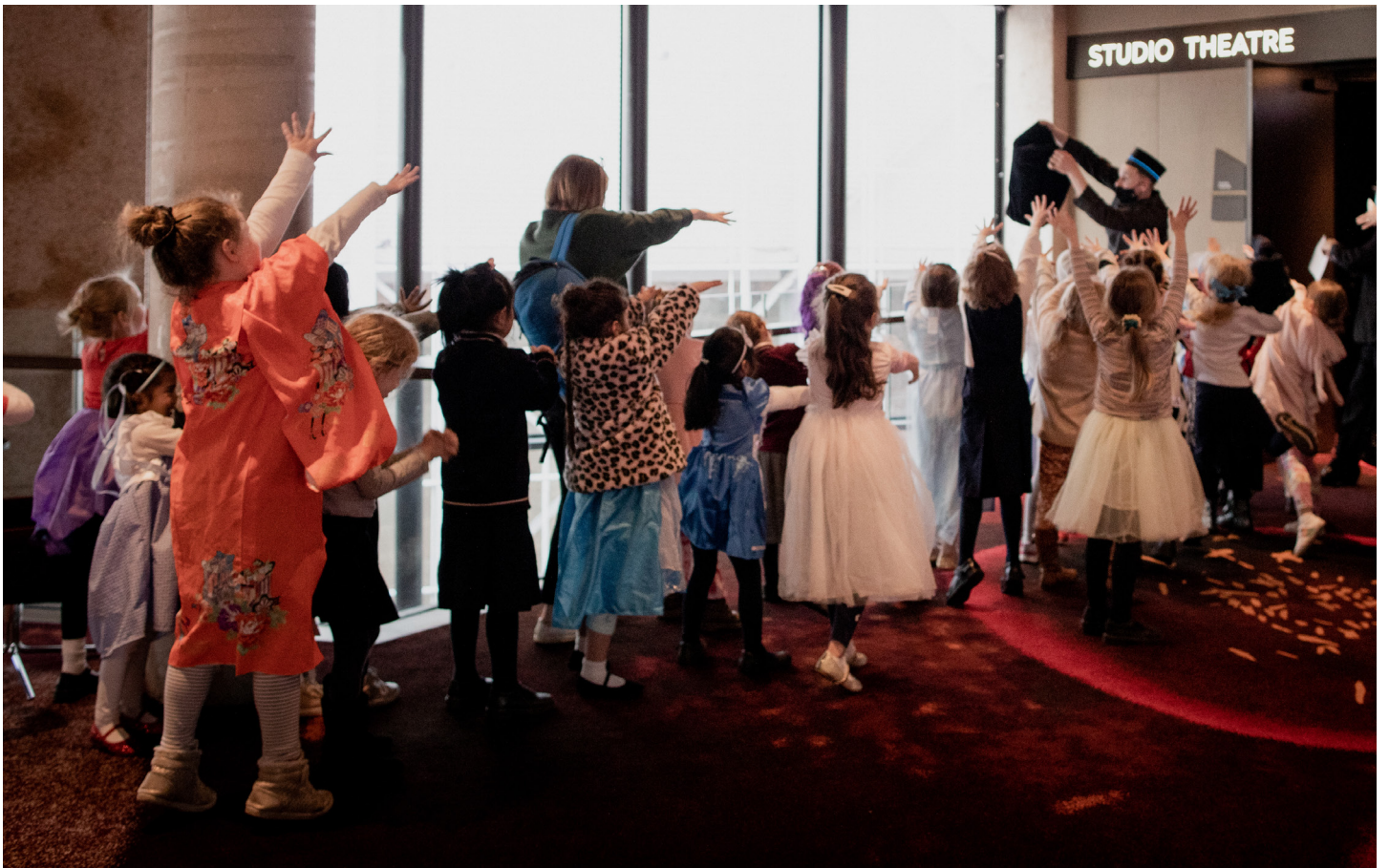
Patch Theatre Zoom school show, August 2022.