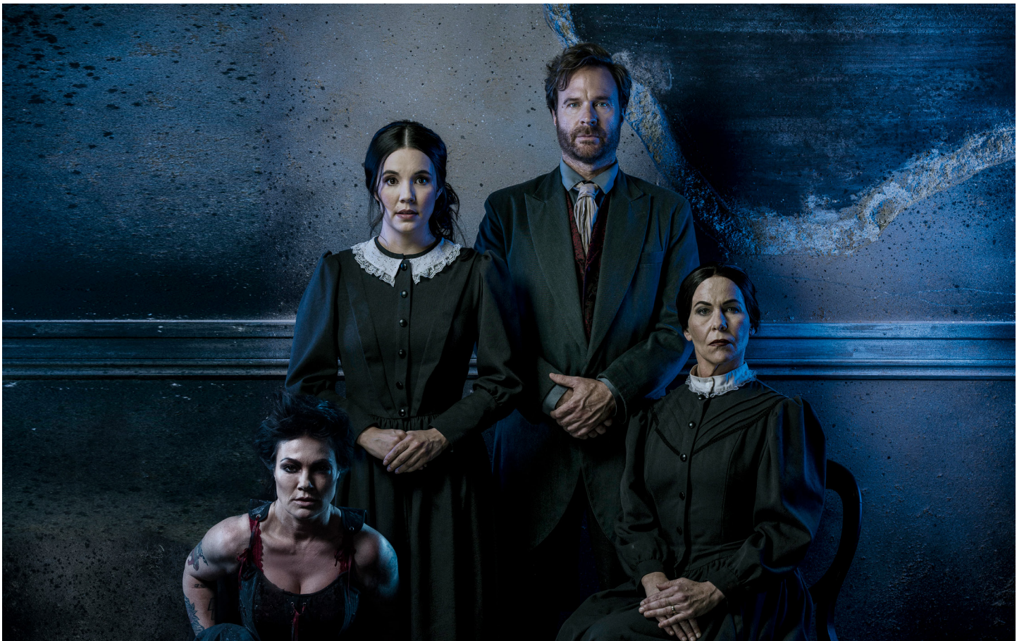
Shake & Stir Theatre Co, Jane Eyre.