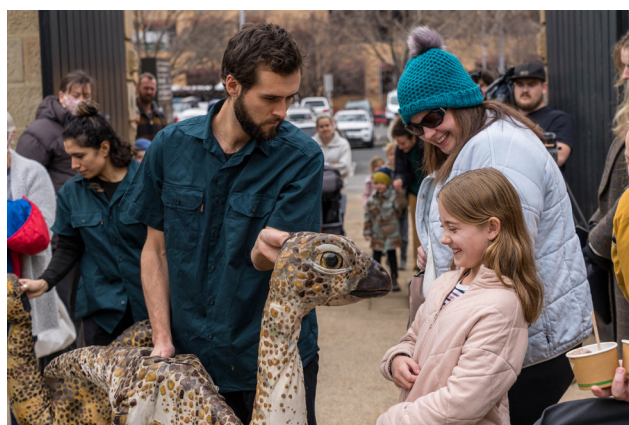
Erth activation, Tasmanian Museum and Art Gallery, July 2022.