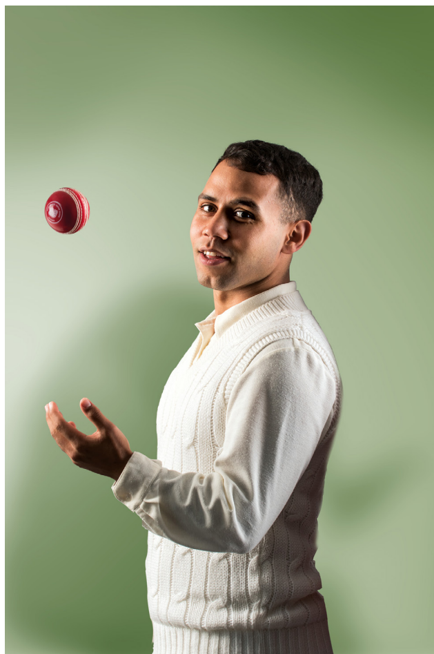
Ensemble Theatre, Black Cockatoo.